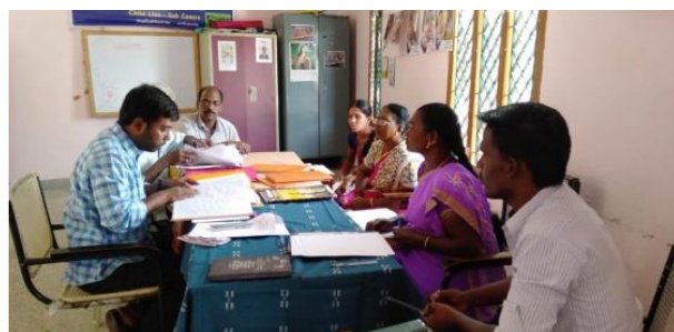
Monitoring and Facilitation Visit