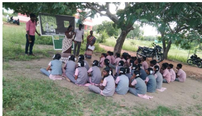
School Awareness Program